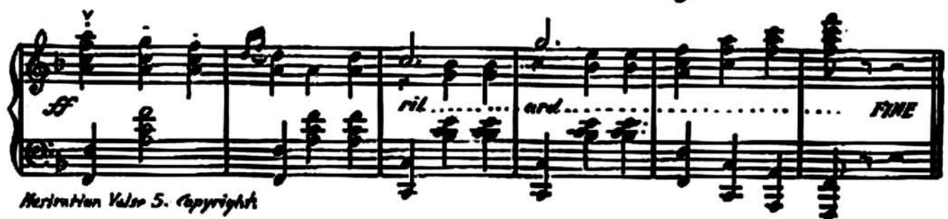
Illustration Valse 5. Copyright