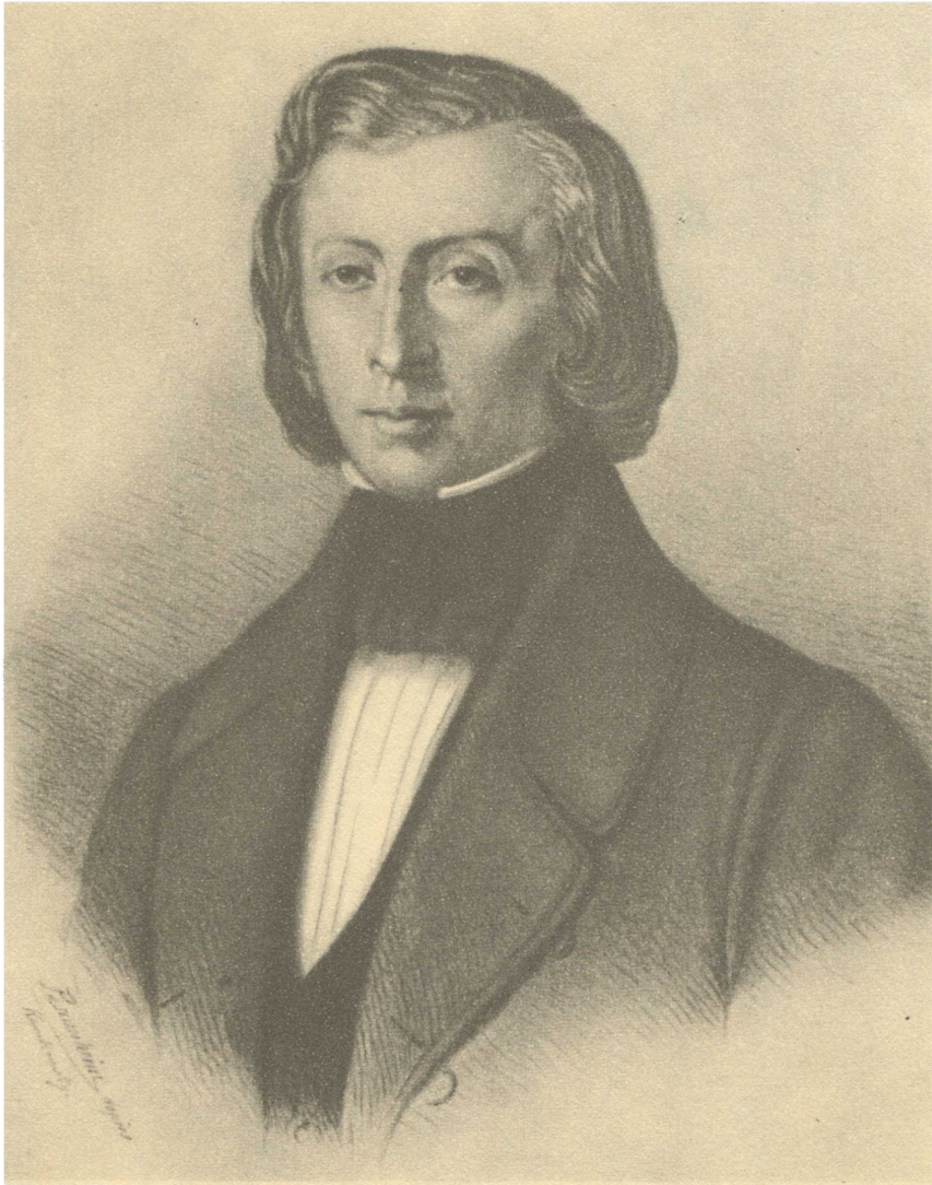
HERMANN RAUNHEIM - LITHOGRAPH - c. 1844